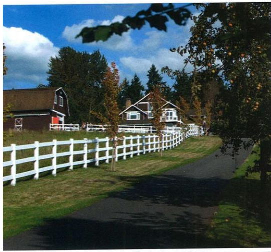
WOODINVILLE LOCATIONS, LEFT TO RIGHT: ADAMS BENCH WINERY, BETZ FAMILY WINERY; WINE BARREL, ADAMS BENCH; NOVELTY HILL JANUIK TASTING ROOM; COLUMBIA WINERY TASTING ROOM