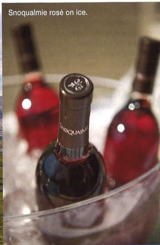
Snoqualmie rosé on ice.